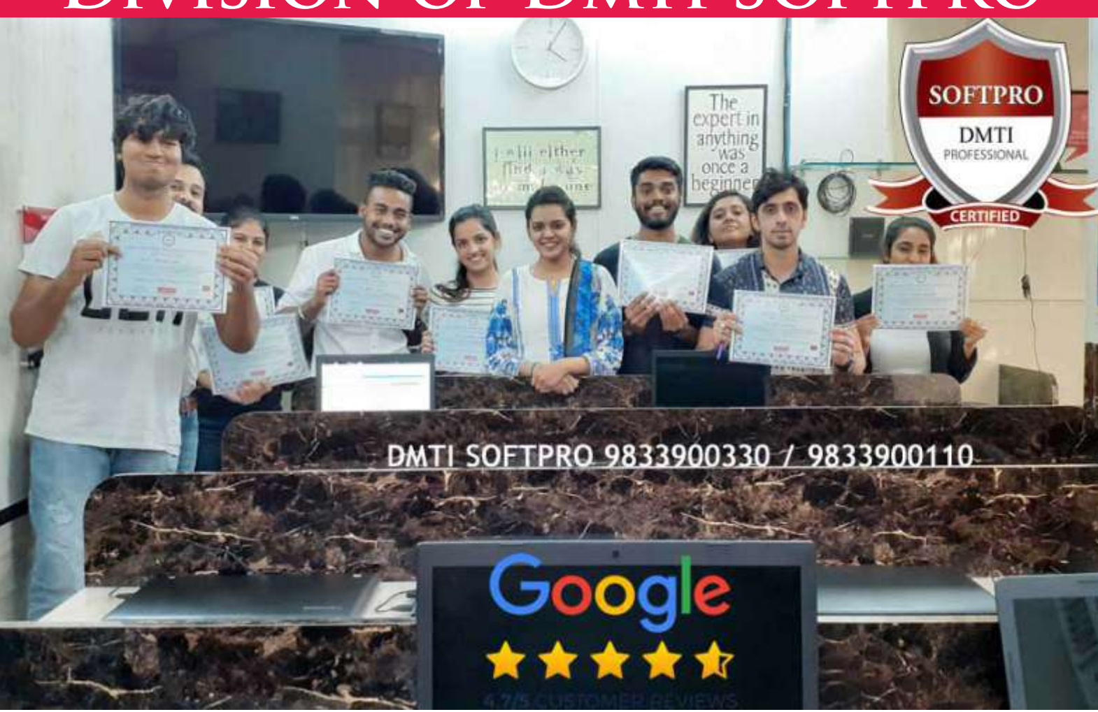
Batch Conducted at Andheri - Thane - Dadar - Matunga Rd West

Dadar: Address: B/2, Vimal Udyog Bhavan, 1st Flr, Nr BPL Mobile, Opp. MOVIE TIME Cinema, Nr Yashwant Natak Mandir, 5 Min from Matunga Rd West Stn, 15 Min from Dadar West, Mumbai- 400016. Andheri Address: PEARL PLAZA, 704, 7th Floor, Just Outside Andheri West Station, Masjid Gali, 1 Min Walk from Andheri West Station. Thane Address: 2 Min Walk from Thane Station. 401, Shreeji Ashish Society, Lohar Ali Rd, near Bhanushali Hospital, Thane West.